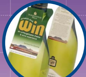
PROTAG NECK-TAGS SINGLE LAYER