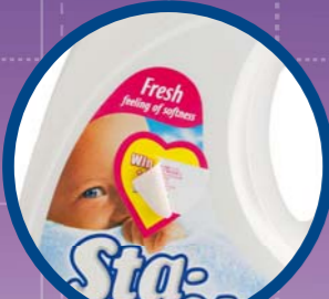
DOUBLE-LAYER LABELS WING LABEL