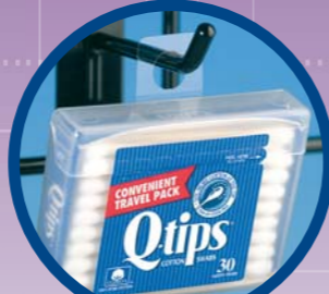
DO-IT HANG TABS