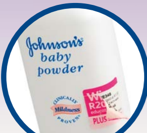
MOBILE INTERACTIVE (SMS, MMS, QR CODE, MOBI SITE, ANALYTICS)