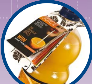
PROTAG NECK-TAGS FOLD-ON