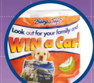
SINGLE-LAYER LABELS REVERSE PRINTED