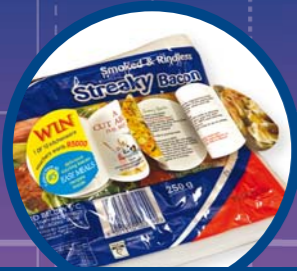
FIX-A-FORM LEAFLET-TAGS STANDARD