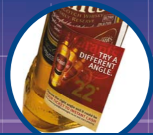
FIX-A-FORM LEAFLET-TAGS SPECIAL FEATURES